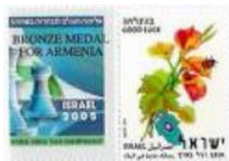
Israeli stamps for 2005 World Team Championship

1.e4 c5 2.Nf3 d6 3.d4 cxd4 4.Nxd4 Nf6 5.Nc3 a6 6.Be3 e5 7.Nb3 Be6 8.f3 Nbd7 9.Qd2 b5 10.a4 b4 11.Nd5 Bxd5 12.exd5 Nb6 13.Bxb6 Qxb6 14.a5 Qb7 15.Bc4 g6 16.Ra4 Rb8 17.Nc1 h5 18.Na2 Bh6 19.Qe2 0-0 20.Nxb4 e4 21.0-0 exf3 22.Qxf3 Ng4 23.Nc6 Qxb2 24.Nxb8 Qxb8 25.Kh1 Ne3 26.Re1 Nxc2 27.Rg1 Be3 28.Rf1 Bc5 29.Bxa6 Ne3 30.Re1 Qb2 31.Bf1 Qd2 32.Rea1 Re8 33.R4a2 Qd4 34.Bb5 Re5 35.Bd7 Rxd5 36.Re1 Re5 37.a6 d5 38.Rb1 Re7 39.Bh3 h4 40.Rc1 Kg7 41.Bc8 Ba7 42.Bh3 Qb4 43.g4 hxg3 44.hxg3 Qb6 45.Qf4 Bb8 46.Qf2 Be5 47.Qf3 Bd4 48.Re1 Qb3 49.Rae2 Qa3 50.Bf1 Re6 51.Qf4 Qc3 52.Bh3 Re4 53.Qf3 f5 54.Bf1 Bc5 55.Rxe3 Bxe3 56.a7 Qxe1 57.a8Q Bf2 58.Kg2 Bxg3 59.Qxg3 Rg4 60.Qxg4 fxg4 ½-½